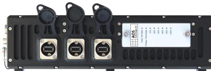
ASTREC-4 with 3x USB interface and UPS

MIL-STD-810F - 500.4 Proc. II MIL-STD-810F - 501.4 Proc. I MIL-STD-810F - 503.4 Proc. I MIL-STD-810F - 507.4 MIL-STD-810F - 513.5 Proc. I, II and III MIL-STD-810F - 514.5 MIL-STD-810F - 516.5 Proc. I & V RTCA-DO-160 G §8 category R Test report available on request